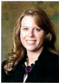
Hon. Kendra Culpepper Criminal District Attorney Rockwall County