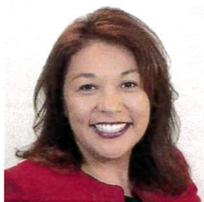
Hon. Celina Vasquez Justice of the Peace Brazos County